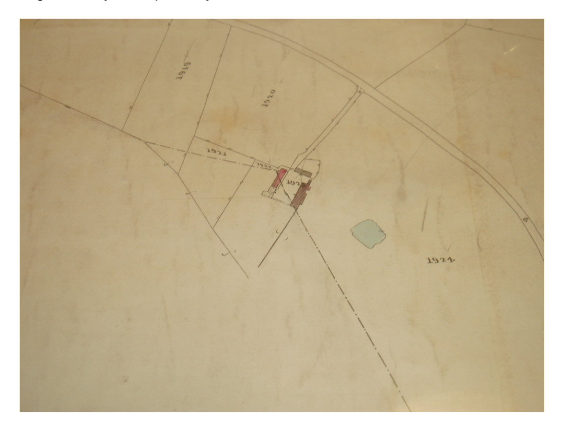
Fig 5: 1854 conveyance plan: