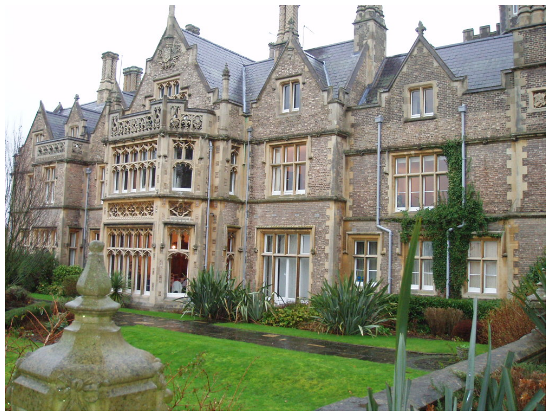
North west elevation