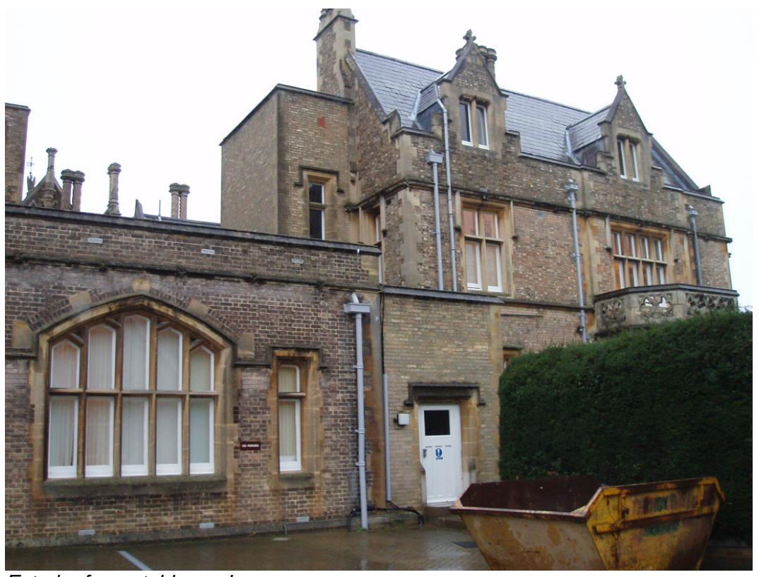
Exterior from stable yard