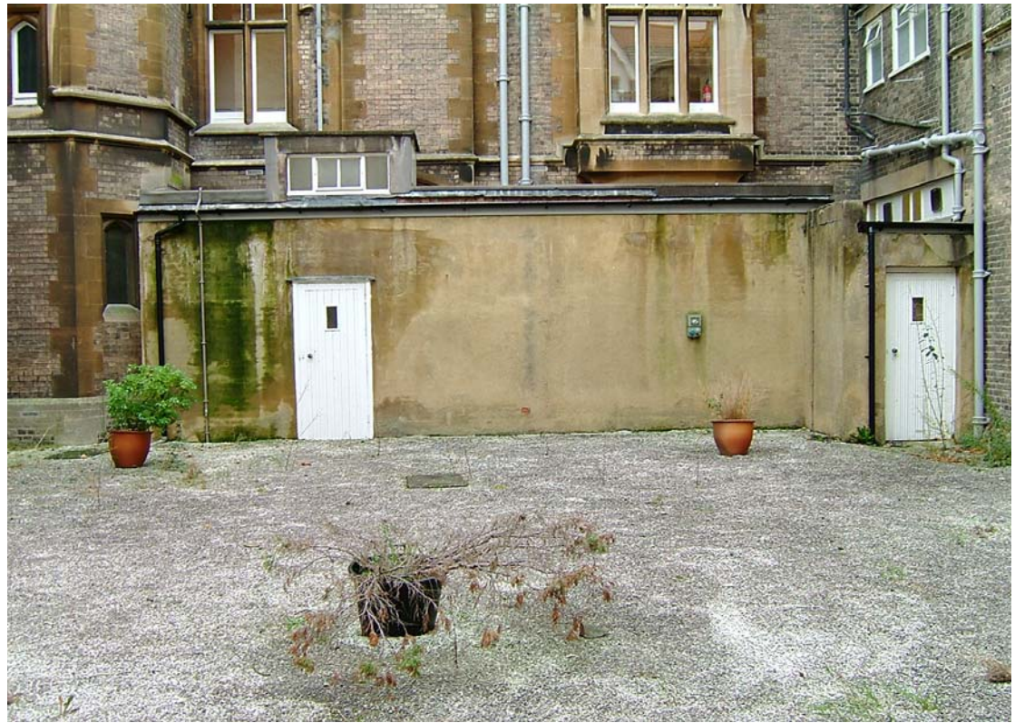
BTC-era single-storey extension to south of courtyard