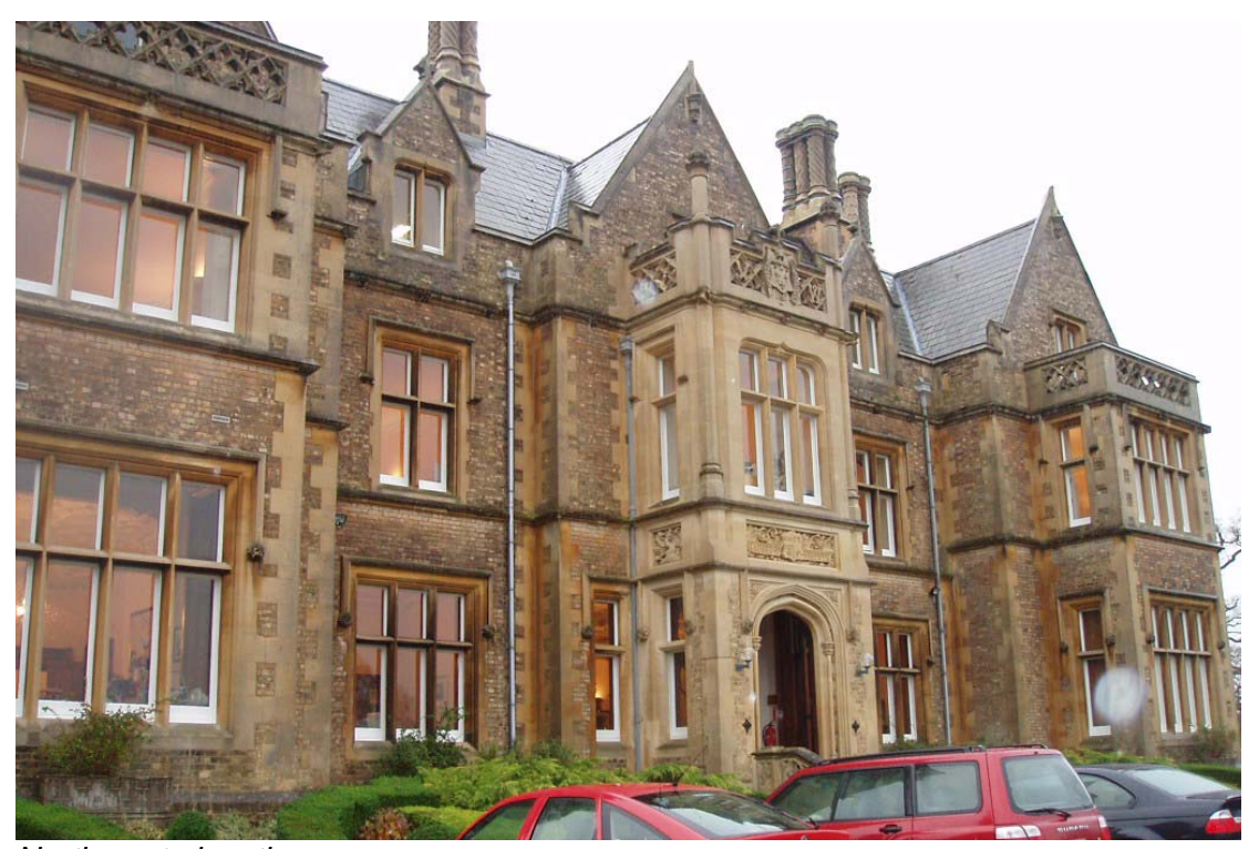
North east elevation