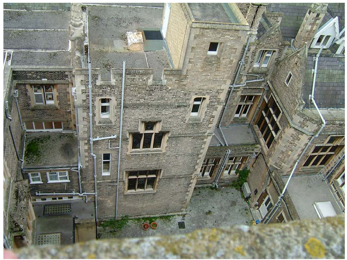
Courtyard facing north west (with BTC-era four storey lift shaft)